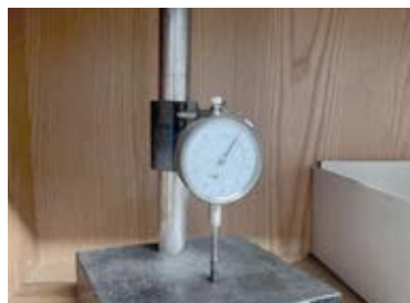
Granite Surface Plate Mic Stand