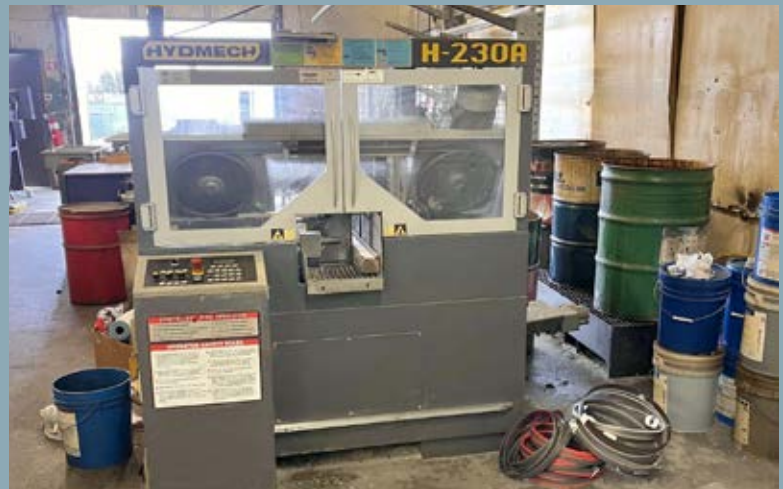
Hydmech H-230A Fully Automatic Horizontal Bandsaw