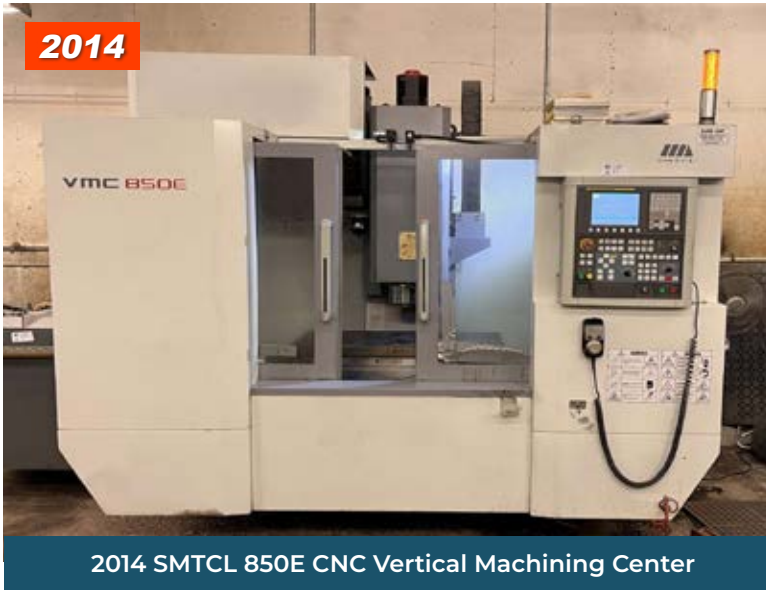
2014 SMTCL 850E CNC Vertical Machining Center