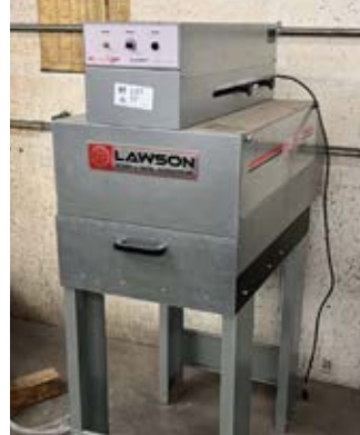
Lawson Silver Jet Pre-Treat Oven