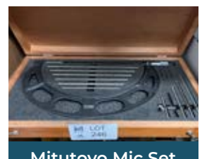
Mitutoyo Mic Set w/V Blocks