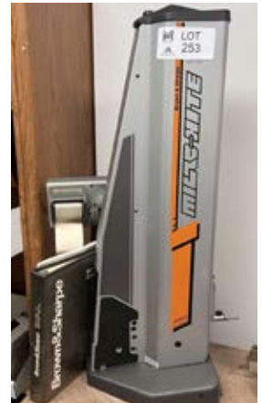
Brown & Sharpe Micro Hite Digital Height Gage