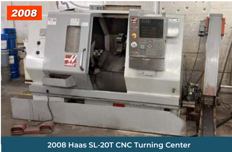
2008 Haas SL-20T CNC Turning Center