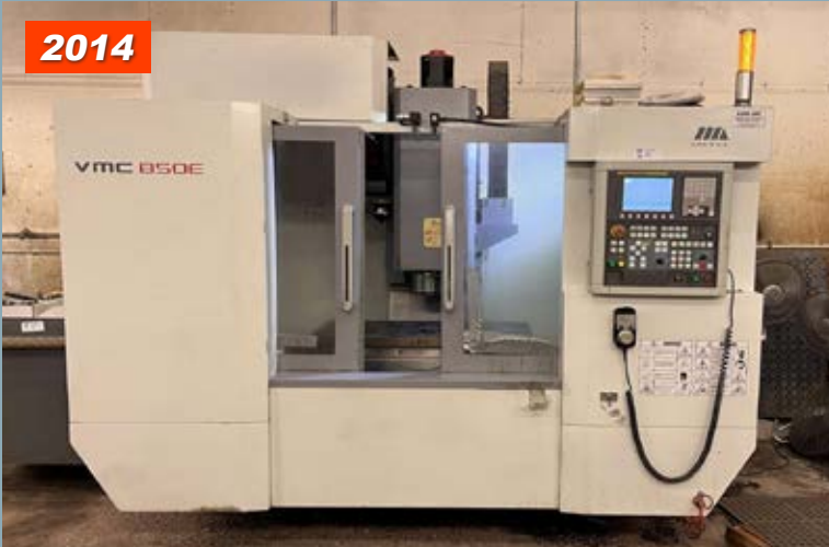
2014 SMTCL 850E CNC Vertical Machining Center