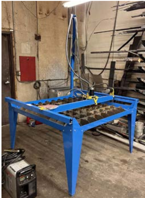
Plasma Cam DHC 2 Plasma Cutter