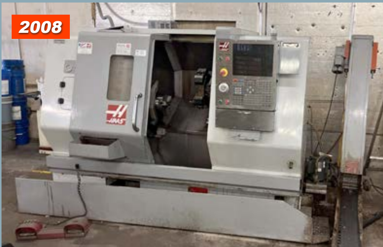
2008 Haas SL-20T CNC Turning Center