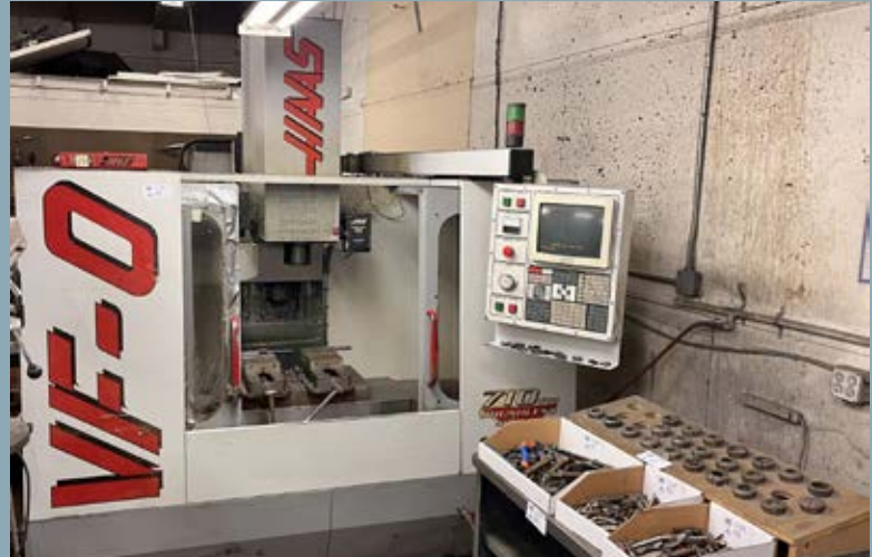
1996 Haas VFO CNC Vertical Machining Center

FEATURING: 2014 SMTCL 850E CNC Vertical Machining Center, 1996 Haas VFO CNC Vertical Machining Center, Hwacheon HIECO-10 CNC Turning Center, 2008 Haas SL-20T CNC Turning Center, Plasma Cutter, Hydmech H-230A Fully Automatic Horizontal Bandsaw, Tooling, Support Equipment and More!