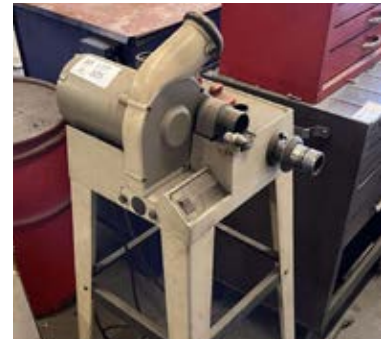
Darex SP2500 Drill Sharpener