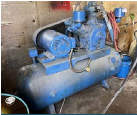
Piston Style Air Compressor