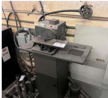
Accu-Finish Series II Disc Grinder