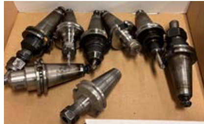
Cat-40 Tool Holders