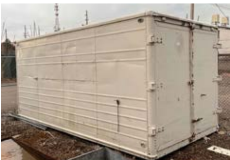
Metal Container w/Contents