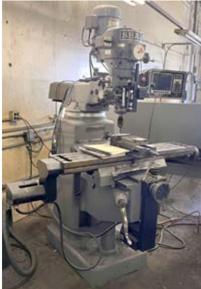
Sharp 2 Axis CNC Knee Mill w/Track AGE 2 Control