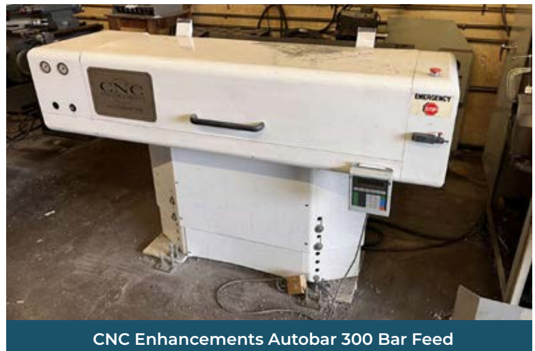
CNC Enhancements Autobar 300 Bar Feed