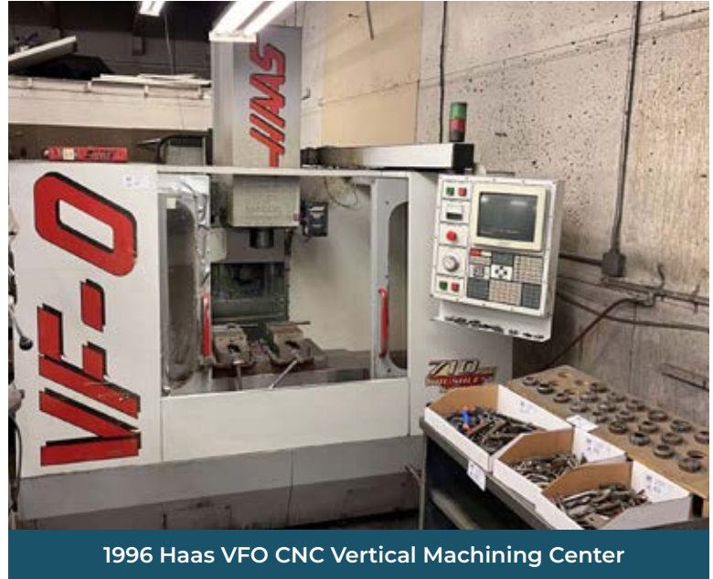
1996 Haas VFO CNC Vertical Machining Center