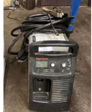
Hypertherm H81M-P33 Welder