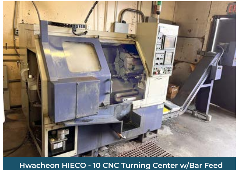
Hwacheon HIECO - 10 CNC Turning Center w/Bar Feed