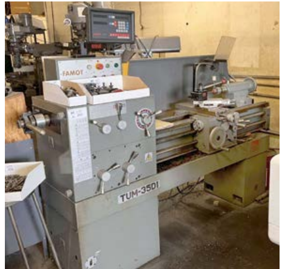
Fامت TUM-35D1 Engine Lathe