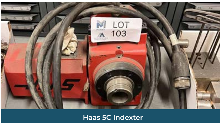
Haas 5C Indexer