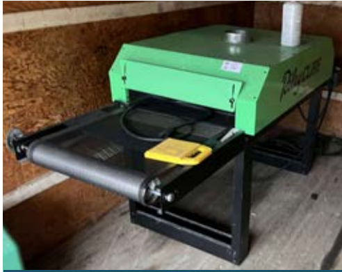
Riley Cure Heat Treat Conveyor

Riley Cure Heat Treat Conveyor Lawson Silver Jet Pre-Treat Oven Hypertherm H81M-P33 Welder Mr Deburr Deburring Machine Cat-40 Tool Holders QTY of DX6 and Kurt Vises Lista Cabinet Red Toolbox Piston Style Air Compressor Rack w/Bar Stock Included Metal Containers Scrap Metal and Much More!