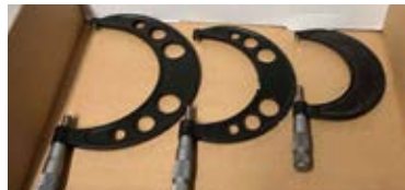
Brown & Sharpe Outside Mic's