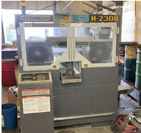
Hydmech H-230A Fully Automatic Horizontal Bandsaw

Hydmech H-230A Fully Automatic Horizontal Bandsaw Sharp 2 Axis CNC Knee Mill w/Track AGE 2 Control Fامت TUM-35D1 Engine Lathe Accu-Finish Series II Disc Grinder Jet Planer Darex SP2500 Drill Sharpener Darex Drill Sharpener Kira Drill Press and More!