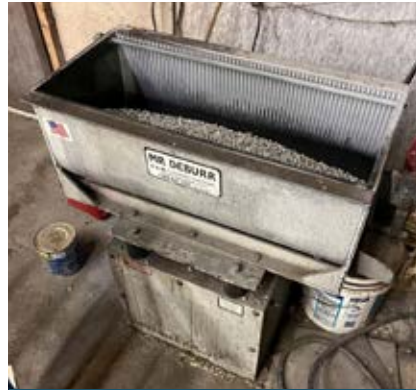
Mr Deburr Deburring Machine