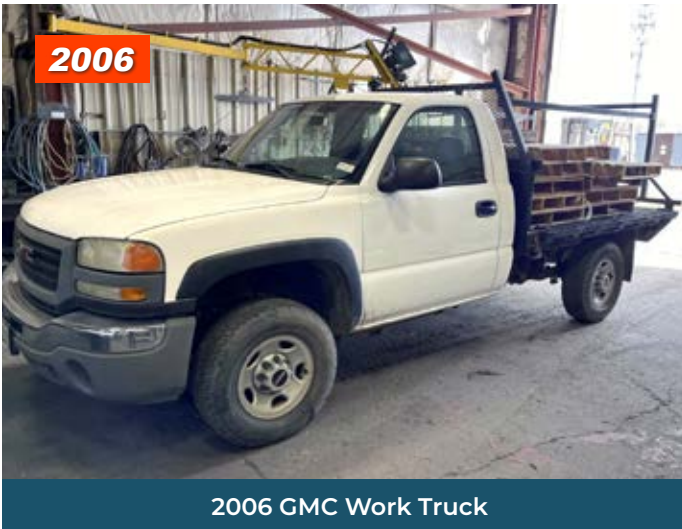
2006 GMC Work Truck

2006 GMC Work Truck 2012 GMC 2500HD Work Truck