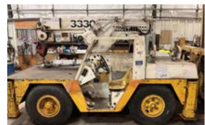
Drott Case 3330 13600 lb Diesel Crane