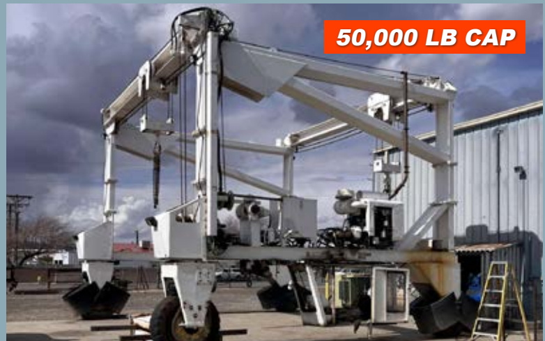
Robco 4 Wheel 50,000 lb Diesel Gantry Crane