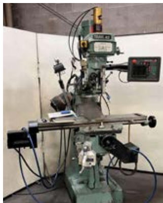
Trak K2 Knee Mill w/Proto Trak Edge DRO

Mechanicy FWA41M Universal Knee Type Milling Machine Trak K2 Knee Mill w/Proto Trak Edge DRO Comet Knee Mill