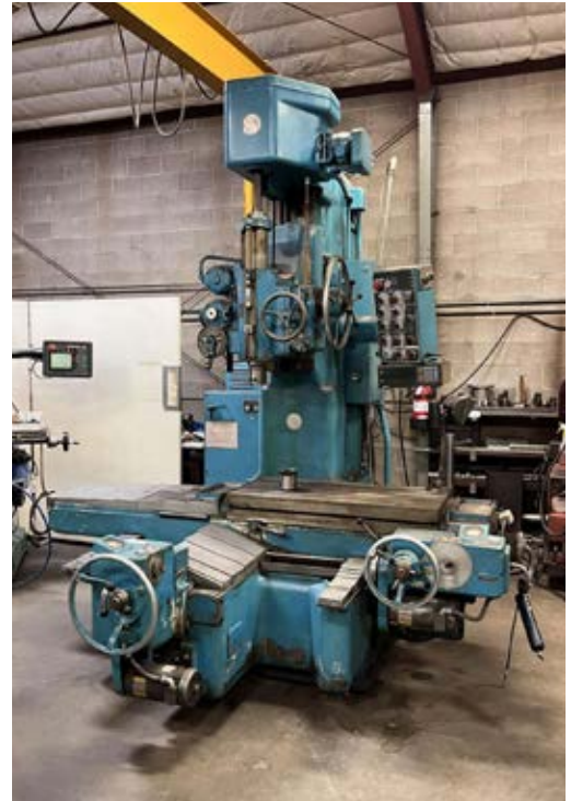
Pratt & Whitney 2E Jig Bore