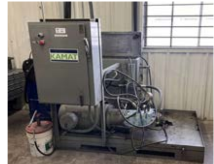
Kamat Hydraulic Pump