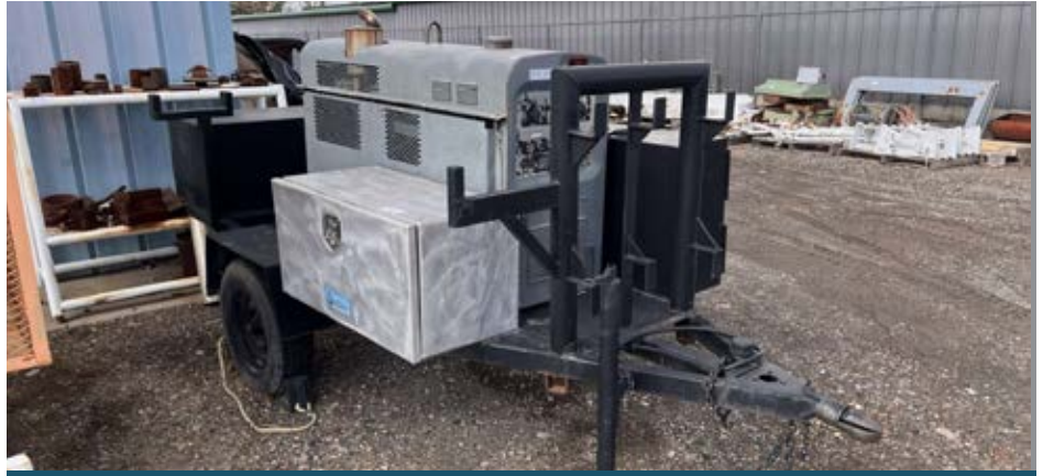
Lincoln Welder w/Custom Trailer