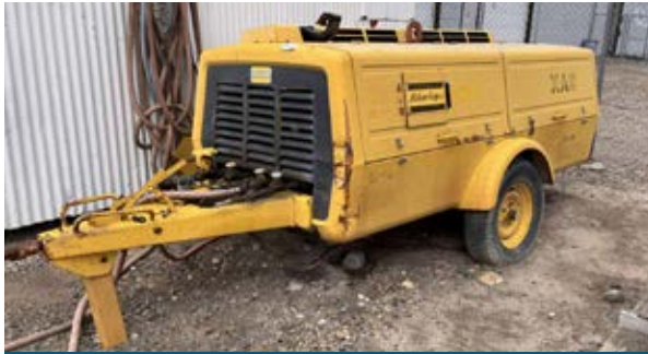
Atlas Copco Air Compressor & Trailer