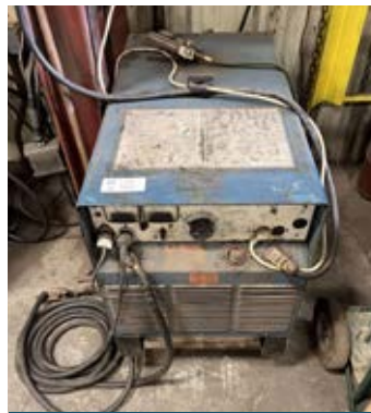
Miller MP/655 Welder