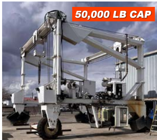
50,000 LB CAP

Robco 4 Wheel 50,000 lb Diesel Gantry Crane Drott Case 3330 13600 lb Diesel Crane Drott Case 85 8500 lb Diesel Crane Jib Crane w/1-Ton Electric Hoist Gibs Crane w/Electric Hoist Gibs Crane w/1/2-Ton Electric Hoist and More!