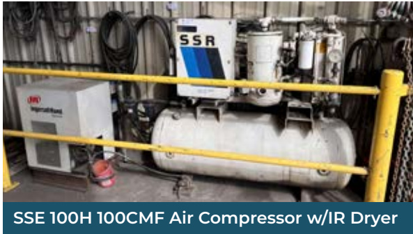
SSE 100H 100CMF Air Compressor w/IR Dryer

Nut Buster 38-Ton w/Misc Tooling Kamat Hydraulic Pump CHUN MU 300-Ton Press w/Tooling Atlas Copco Air Compressor & Trailer SSE 100H 100CMF Air Compressor w/IR Dryer Phoenix DryRod Electric Stabilizing Oven Lempco 500A 40-Ton Hydraulic H-Frame Brake Press Vangaurd 16 HP Pressure Washer w/Hot Seed Hauhinco High-Pressure Pump w/Detroit Diesel Engine Electric Motors, Metal Racks, Scrap & Sheet Metal, Carts, Engine Stands, Toolboxes, Metal Cabinets and More!