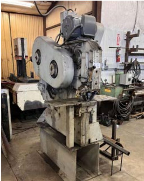
Peddinghaus 210A/13 Ironworker