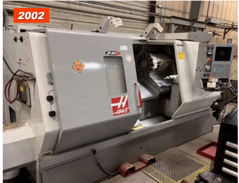
2002 Haas SL-30T CNC Turning Center