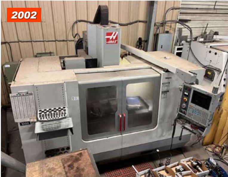
2002 Haas VF4D CNC Vertical Machining Center