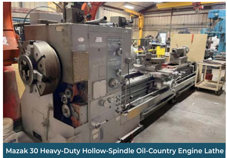
Mazak 30 Heavy-Duty Hollow-Spindle Oil-Country Engine Lathe