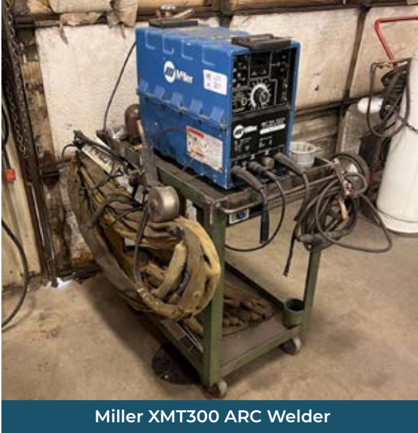
Miller XMT300 ARC Welder

Lincoln Welder w/Custom Trailer Miller XMT300 ARC Welder Miller MP/655 Welder w/Swinging Wire feeder Hobart Mega Mig Welder w/Miller 30E Lincoln Ranger 250 Welder Miller Matic S54A, S32S, 30A Welders and More!