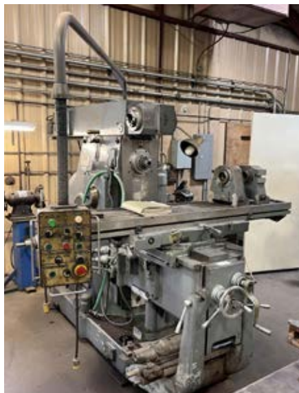
Mechanicy FWA41M Universal Knee Type Milling Machine