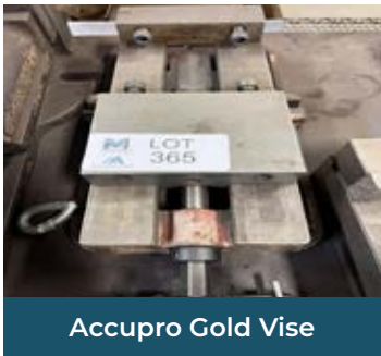
Accupro Gold Vise