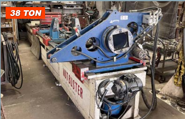
Nut Buster 38-Ton w/Misc Tooling

FEATURING: (3) Buildings & Grounds Filled with Over 50 Years of Business Including: CNC Machinery, Complete Machine Shop, Fasteners, Welders, Material Handling, Trucks, Forklifts, Cranes, Metal Toolboxes, Cabinets, Huge QTY Scrap Metal and Much More! Everything Must Go!