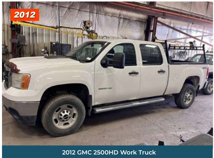
2012 GMC 2500HD Work Truck