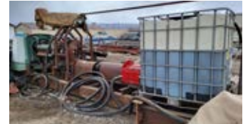
Hauhinco High-Pressure Pump