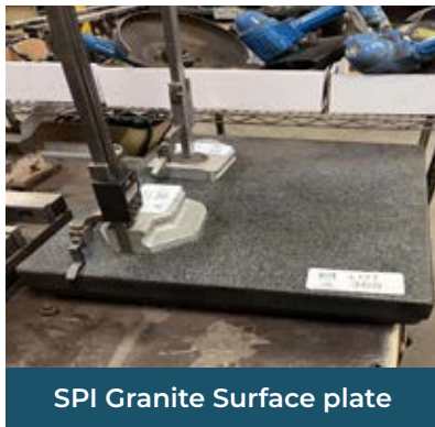
SPI Granite Surface plate