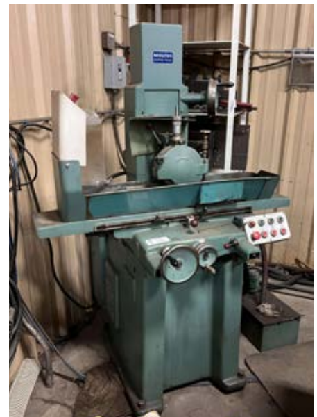
Malcus MPS-450 Centerless Grinder