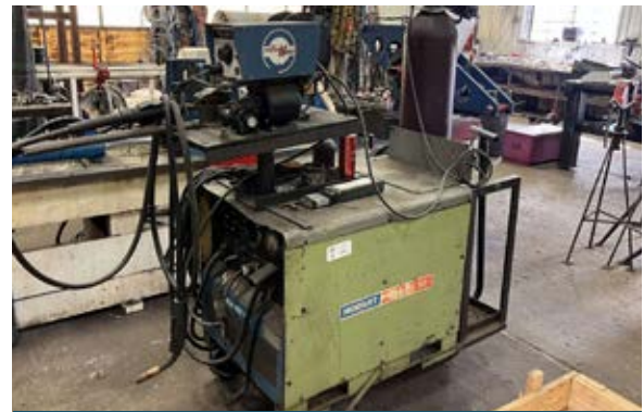
Hobart Mega Mig Welder