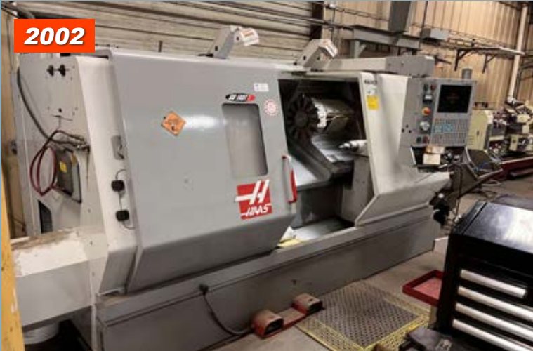
2002 Haas SL-30T CNC Turning Center

ONSITE PREVIEW: Monday, April 1 st from 9:00am to 2:30pm MT PREVIEW LOCATION: 2508 Industrial Ct, Grand Junction, CO 81505 Upcoming Auctions & Bidding Information: www.MidstateMach.com