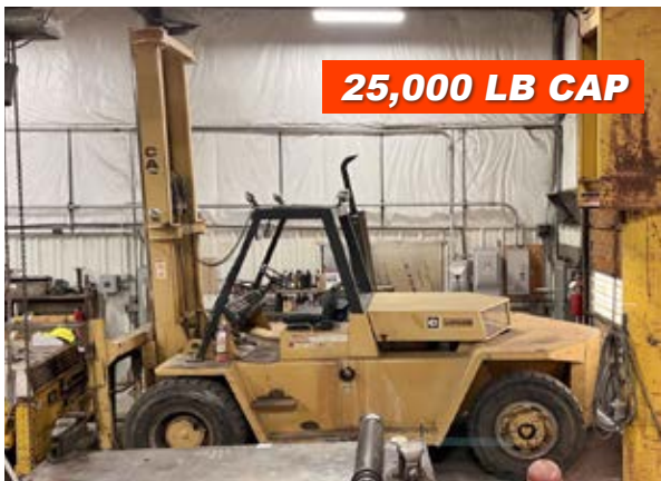
25,000 LB CAP

Catipiller V250B 25,000 lbs Diesel Forklift Hyster Forklift Non-Operational