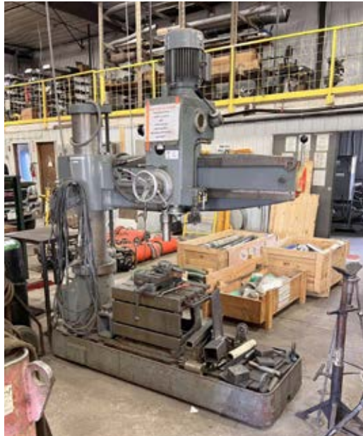
Meuser M35R Radial Arm Drill

Peddinghaus 210A/13 Ironworker Meuser M35R Radial Arm Drill w/Misc Tools Continental Machine Tool LF-100M Horizontal Bandsaw Powermatic Pedestal Grinder Pedestal Grinder Pratt & Whitney 2E Jig Bore Gould & Eberhardt 14 Gear Cutting Machine Malcus MPS-450 Centerless Grinder and More!