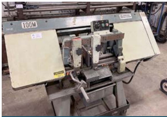
Continental Machine Tool LF-100M Horizontal Bandsaw

Peddinghaus 210A/13 Ironworker Meuser M35R Radial Arm Drill w/Misc Tools Continental Machine Tool LF-100M Horizontal Bandsaw Powermatic Pedestal Grinder Pedestal Grinder Pratt & Whitney 2E Jig Bore Gould & Eberhardt 14 Gear Cutting Machine Malcus MPS-450 Centerless Grinder and More!