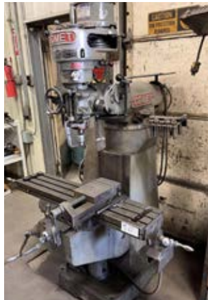
Comet Knee Mill