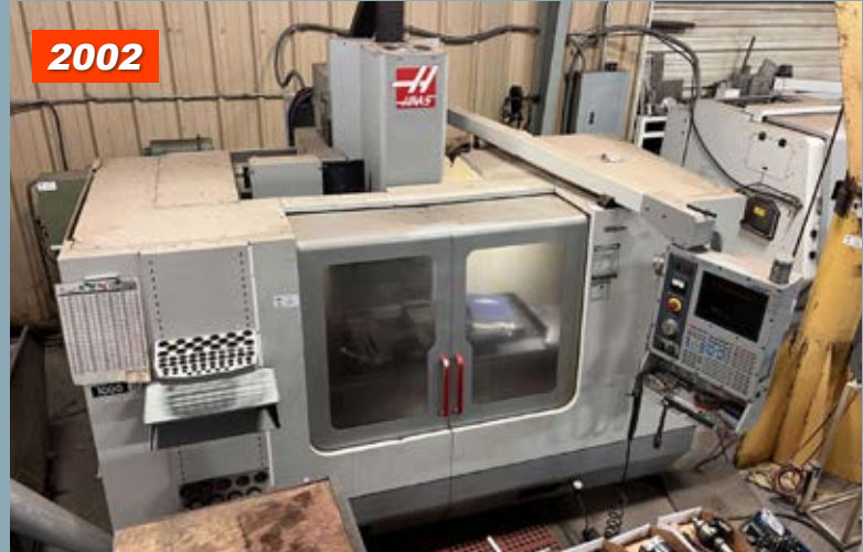
2002 Haas VF4D CNC Vertical Machining Center

FEATURING: (3) Buildings & Grounds Filled with Over 50 Years of Business Including: CNC Machinery, Complete Machine Shop, Fasteners, Welders, Material Handling, Trucks, Forklifts, Cranes, Metal Toolboxes, Cabinets, Huge QTY Scrap Metal and Much More! Everything Must Go!