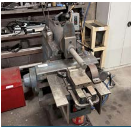
Gould & Eberhardt 14 Gear Cutting Machine